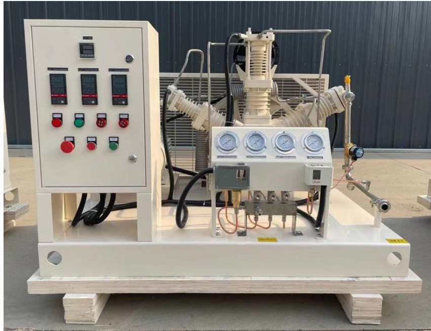
3 Stage Air Cooled Booster Compressor