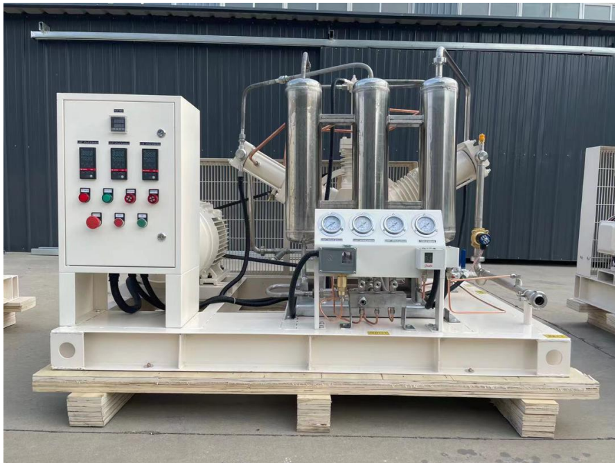
3 Stage Water Cooled Booster Compressor